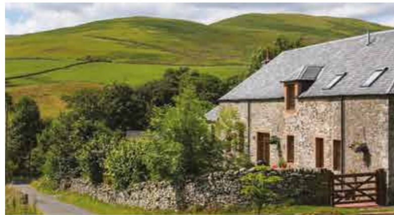
▲ Scottish Borders: Ladhope Steading, Yarrow Valley. This steading conversion is set on the south bank of the Yarrow Water, in a pretty hamlet within commuting distance of Edinburgh. Master suite, 3 further beds, family bath, kitchen/family room, 3 receps, utility, WC, hall with galleried landing, garden, courtyard. £295,000; CKD Galbraith (01573-224244).