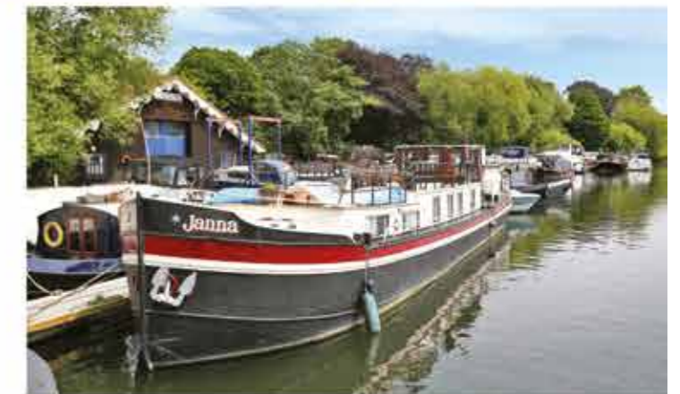
▲ London: Janna, Terrace Gardens Boatyard, Hampton, Richmond, TW12. This 22-metre Luxemotor Dutch Barge was built in 1925, and now sits on a leisure mooring overlooking Taggs Island. Master cabin, single cabin, 1 bath, kitchen/diner, 1 further recep. Mooring and maintenance costs £8,100 per year. £185,000; River Homes (020-8977 4500).