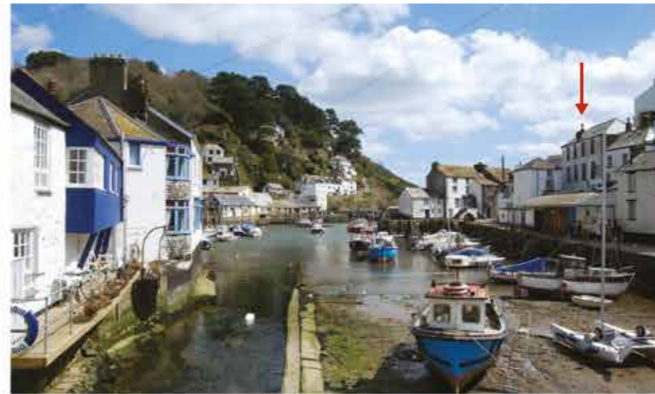
◀ Cornwall: Chapel Rock Studio, Chapel Steps, Polperro, near Looe. A modernised cottage forming the upper two floors of this harbourside building, with fantastic views. The house is just yards from the inner harbour, coastal path, beach and a range of restaurants. Large main bed, 1 further bed, shower room, kitchen/double recep, 1 further recep, hall, store/utility, small courtyard. £350,000; Lillcrap Chilcott (01872-273473).