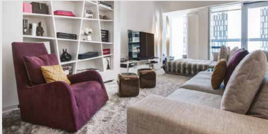
▲ Dubai: Recently upgraded and set within the heart of Dubai Marina, this stylish 3-bedroom duplex residence in the luxurious Canyon Tower offers the highest luxury lifestyle. The residence consists of state of the art furnishing, maid's room, laundry room and a spacious modern kitchen with complete fittings. The facilities include parking for 2 cars, communal steam room, sauna, gymnasium and round-the-clock concierge service. $1.7m; Luxhabitat (+971 4 ) 550 8335.