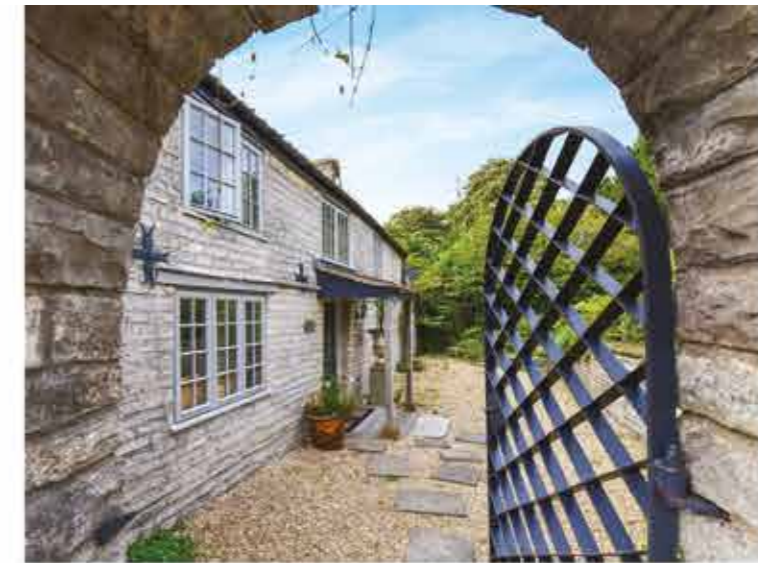
◀ Somerset: Lynch Cottage, Behind Berry, Somerton. This well-presented period cottage is tucked away, with its own private driveway, yet is within walking distance of Somerton town centre. Master suite, 2 further suites, kitchen, 2 receps, detached double garage, parking, front and rear gardens. £475,000; Palmer Snell (01458-272989).