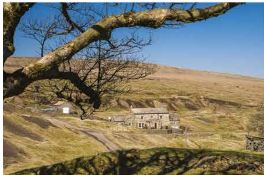
◀ Northumberland: Sunnyside, Coalcleugh, Hexham. Set at the head of the West Allen Valleys in the Northern Pennines – an Area of Outstanding Natural Beauty – this house offers off-grid living, with its own wind turbine and battery bank. 3 beds, family bath, kitchen/dining room, 1 further recep, family room, study, utility, boot room, cloakroom/WC, garage, former powder house, garden. £495,000; Finest Properties (01434-622234).