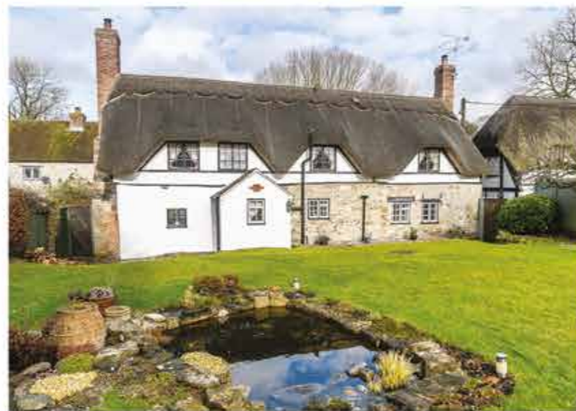
◀ Wiltshire: 14-15 Stockton, Stockton, near Warminster. Situated in an Area of Outstanding Natural Beauty in the Wylde Valley, this Grade II, 17th century cottage sits in the heart of the popular village of Stockton. Master bed, 2 further beds, family bath, kitchen, breakfast room, 2 receps, brick outbuilding (used as a studio; could be converted into a holiday cottage), summerhouse, garden, 0.15 acres. OIEO £475,000; Fox Grant (01722-782727).